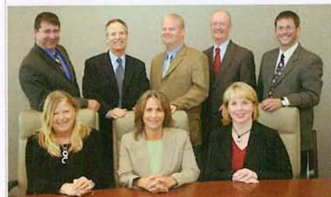
Tulsa's economic development team.