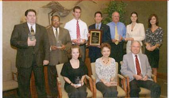
Community and economic development officials from Mobile, Ala.

It doesn't get much better than this for Mobile, Ala. The south Alabama metro, the second largest in Alabama, turned the deal of the year in ThyssenKrupp, a $3.7 billion, 2,700-employee steel plant that is now under