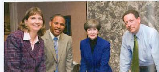
The Victoria, Tex. economic development team.